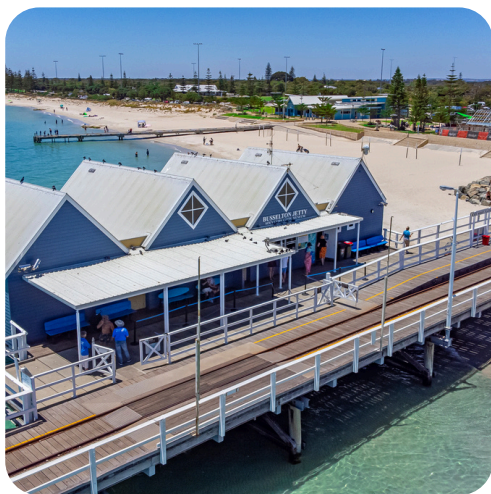
Interpretive Centre Train and Observatory departures

Toilets are available at all Jetty locations, and water fountains are available at the Interpretive Centre and Underwater Observatory. The Busselton Foreshore precinct also has public toilets, water fountains, and showers.