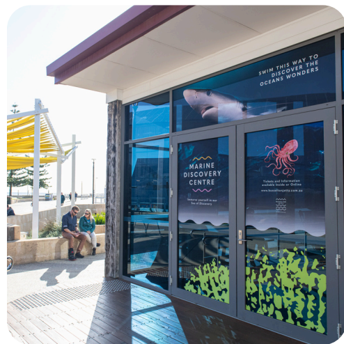
Marine Discovery Centre at the Busselton Visitor Centre